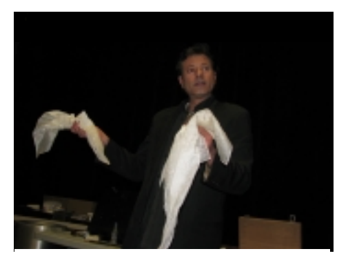
Rocco demonstrates Slydini's Knotted Silks