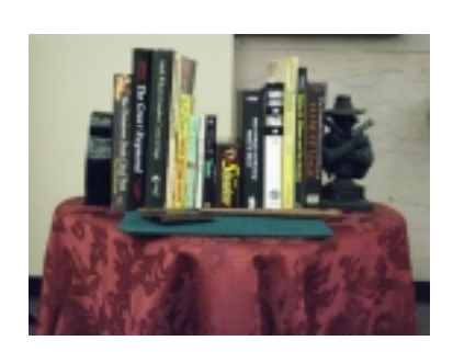
A few of the books Gibson wrote