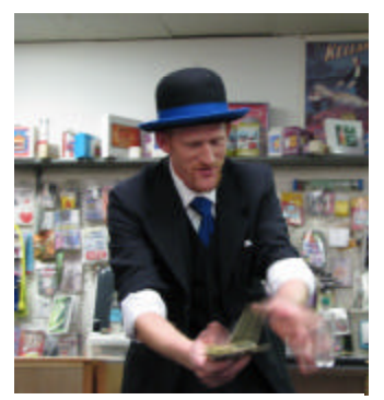
The Heinstein Shuffle

One of Karl's signature effects is the "Heinstein Shuffle," a false riffle shuffle so good it's almost impossible to tell from the real thing, yet the order of the deck is left undisturbed.